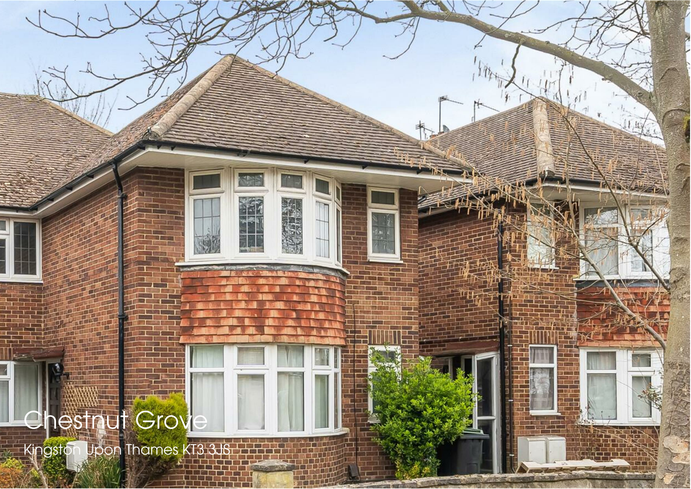
Chestnut Grove Kingston Upon Thames KT3 3J6